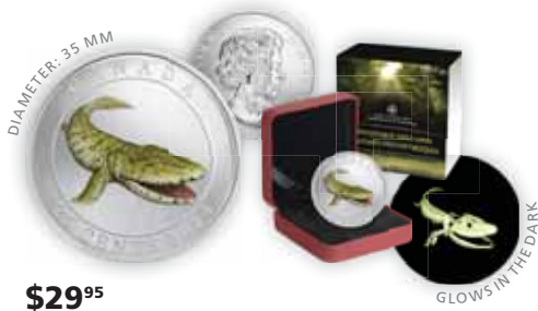
2014 25-Cent Coloured Coin – Prehistoric Creatures: Tiktaalik 244232 ◀