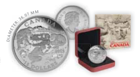
$54 <sup>95</sup> 2015 $15 Pure Silver Coin – Exploring Canada – Scientific Exploration 244497 ▷■ No GST/HST